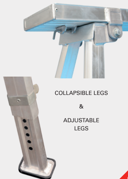
COLLAPSIBLE LEGS & ADJUSTABLE LEGS